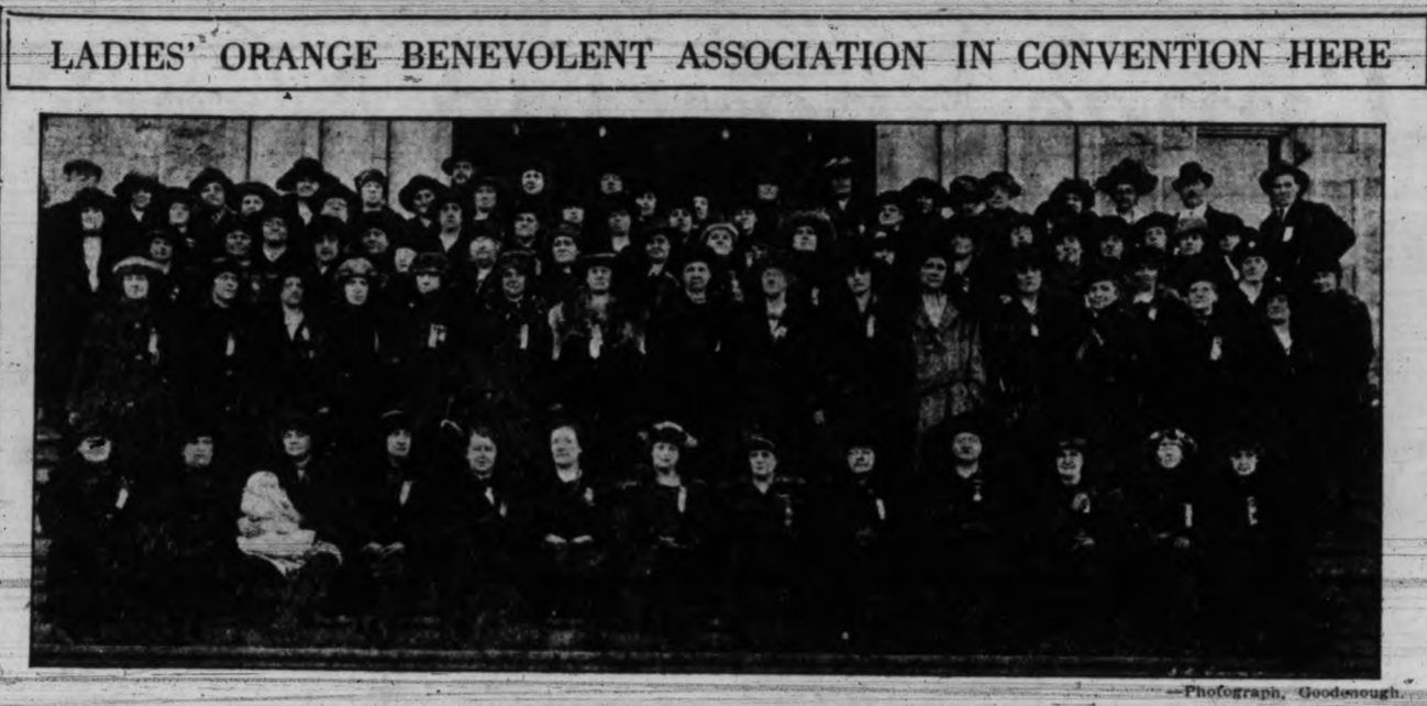
LADIES' ORANGE BENEVOLENT ASSOCIATION IN CONVENTION HERE